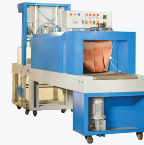
SHRINK WRAPPING MACHINE