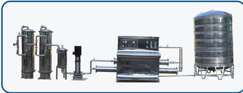
MINERAL WATER TURNKEY PROJECT