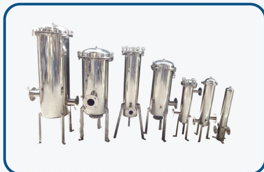
MICRON CARTRIDGE FILTER