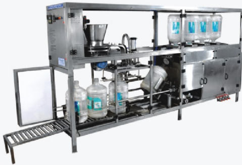
FULLY AUTOMATIC JAR WASHING AND FILLING