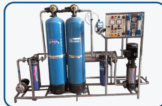
FRP RO PLANT