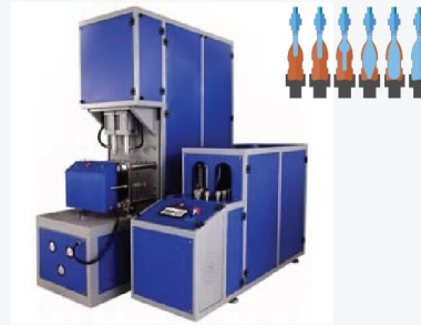
PET BLOW MOULDING MACHINE