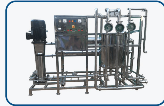
MILK RO PLANT