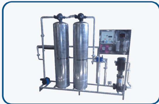
SS RO PLANT